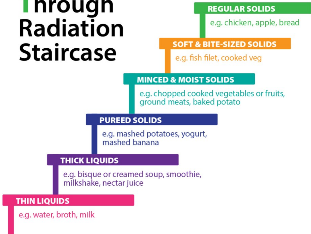
Figure 1. EAT Staircase