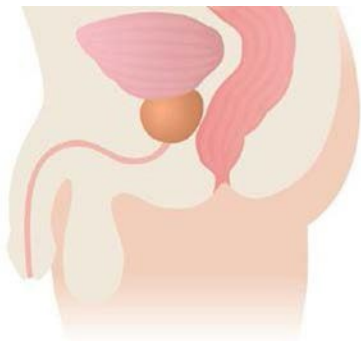
Without SpaceOAR

Because the prostate and rectum sit next to each other, some prostate radiation can injure the rectum, causing complications. To help avoid rectal injury, the space between the prostate and the rectum can be increased by an absorbable gel spacer. The SpaceOAR System is a soft gel-like material that temporarily moves the rectum a half inch away from the high-dose radiation area. The same gel material is used in implants for other medical procedures. Studies have shown that the material is safe to use in the body.