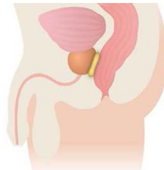
With SpaceOAR