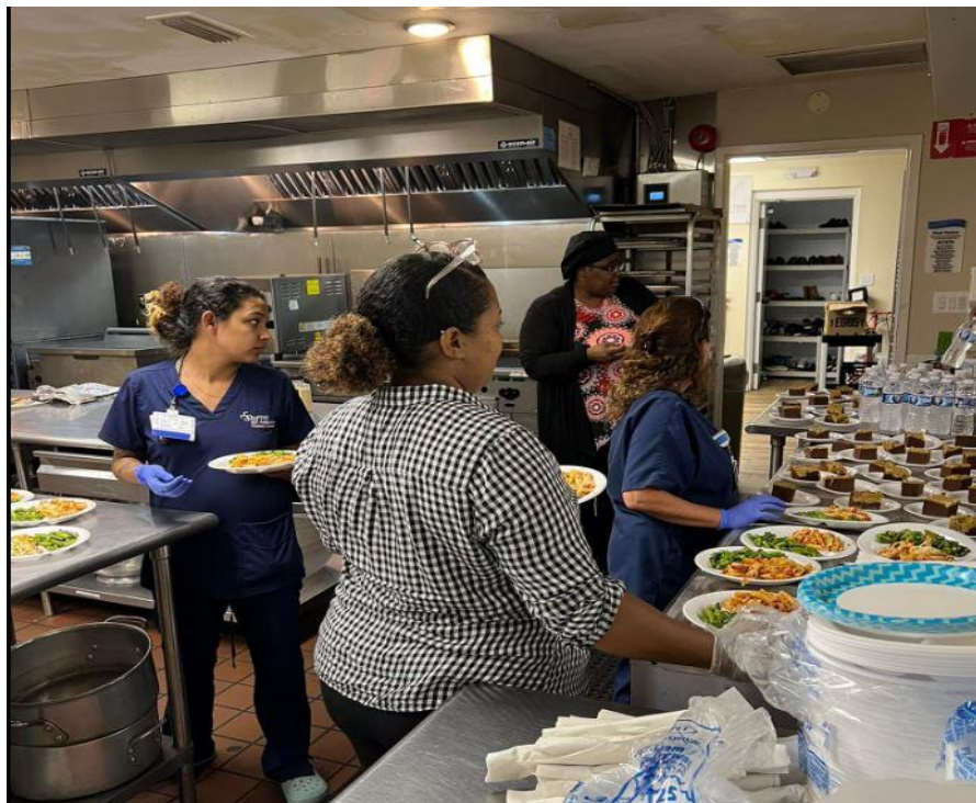
Baptist Beaches Team members Volunteering at Mission House