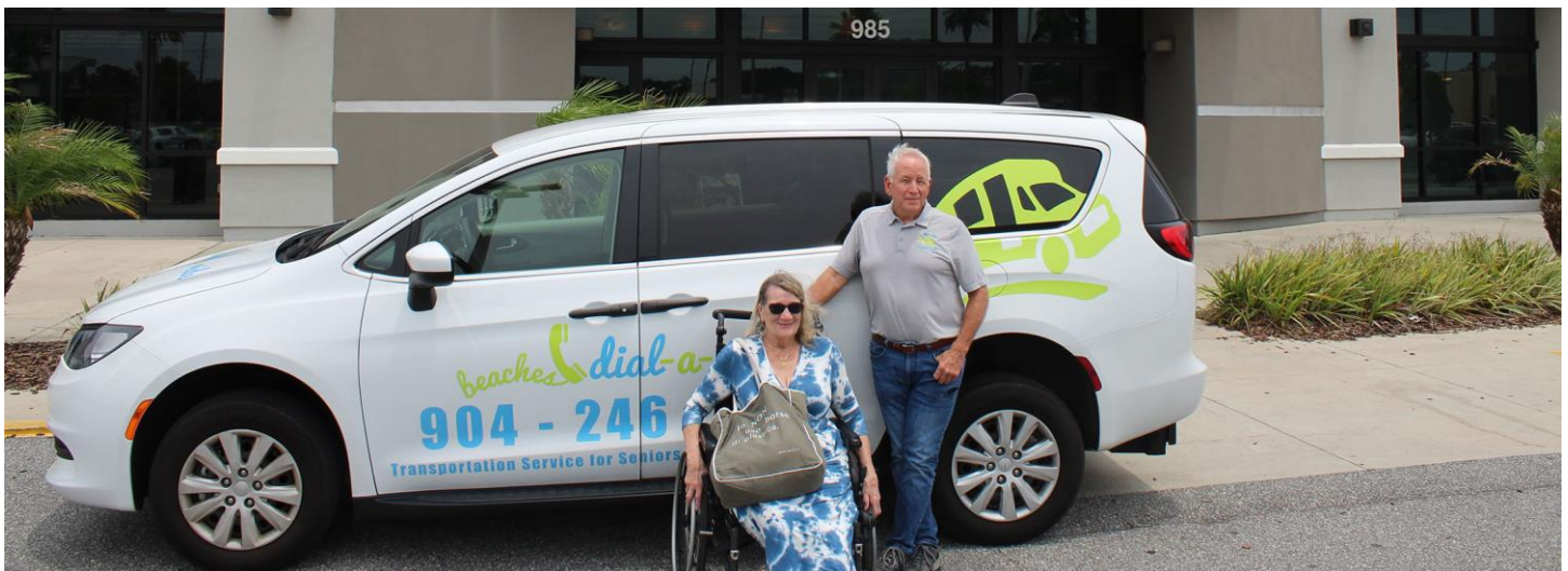
Beaches Council on Aging: Dial-a-Ride offers free transportation for seniors